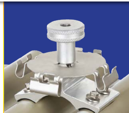
SOLAR CONNECTION KIT

Includes: PowerBolt® and Cable Management Disc