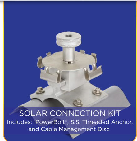
SOLAR CONNECTION KIT Includes: PowerBolt®, S.S. Threaded Anchor, and Cable Management Disc