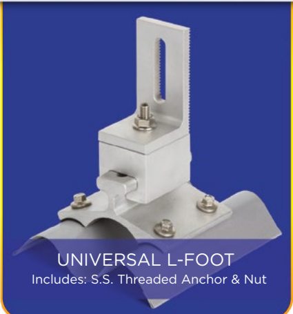
UNIVERSAL L-FOOT Includes: S.S. Threaded Anchor & Nut

Introducing the new Patent-Pending PowerMount™ to be used with virtually any Corrugated Roof System. The PowerMount™ utilizes PowerGlide™ Technology that gives the installer up to 2" of precise adjustment during installation in the field. Use the PowerMount™ with our Universal L-Foot to attach to any solar racking system or go railless and utilize our innovative Solar Connection Kit with GroundBonding™ Technology that is UL 1703 and UL 2703 listed and approved.