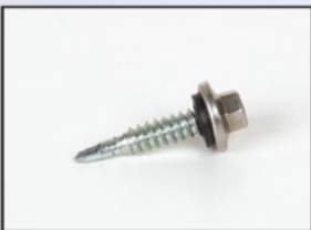
STAINLESS FASTENER W/ EPDM WASHER Compatible With Metal & Wood Applications

Introducing the new Patent-Pending PowerMount™ to be used with virtually any Corrugated Roof System. The PowerMount™ utilizes PowerGlide™ Technology that gives the installer up to 2" of precise adjustment during installation in the field. Use the PowerMount™ with our Universal L-Foot to attach to any solar racking system or go railless and utilize our innovative Solar Connection Kit with GroundBonding™ Technology that is UL 1703 and UL 2703 listed and approved.