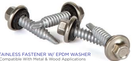
STAINLESS FASTENER W/ EPDM WASHER Compatible With Metal & Wood Applications