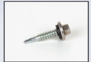
STAINLESS FASTENER W EPDM WASHER Compatible With Metal & Wood Applications

Introducing the new Patent-Pending PowerMount™ to be used with virtually any R-Panel Roof System. The PowerMount™ utilizes PowerGlide™ Technology that gives the installer up to 2" of precise adjustment during installation in the field. Use the PowerMount™ with our Universal L-Foot to attach to any solar racking system or go railless and utilize our innovative Solar Connection Kit with GroundBonding™ Technology that is UL 1703 and UL 2703 listed and approved.